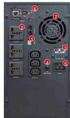
3 kVA (H)